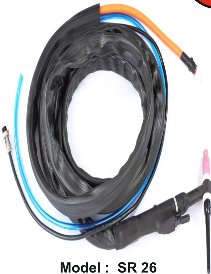
Model : SR 26 250 Amps @ 60% Duty Cycle GAS COOLED