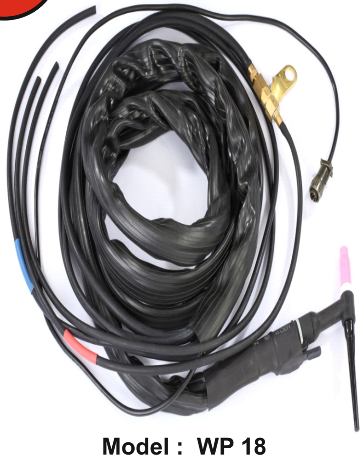
Model : WP 18 400 Amps @ 60% Duty Cycle WATER COOLED